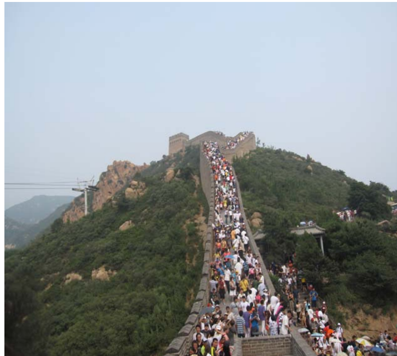
A View from the Great Wall of China

The Great Wall of China, in fact, was most definitely not great. Magnificent, colossal, and extravagant come into mind instead. The Wall is huge—and long, stretching nearly 4,000 miles. We went to the Badaling section near Beijing. The place was extremely crowded, and the tourists switch from pushing you toward the entrance of the Wall, to (once you get near enough to it) pushing away from it. Once you actually get on top of the Great Wall, before you can appreciate the beauty of it all, first you must walk. A lot. However, there are a lot of the strangers who are walking along side you to keep you occupied. For example, as we neared the top of the stairs, a Chinese lady and her son came up to me, waving a camera, saying, “Oh, picture, picture?”. Thinking that she wanted me to take a picture of her and her son, I smiled and nodded, reaching for her camera. But instead of giving me the camera, she held it up, while her son moved forward to stand next to me. It took me a second to realize that she wanted to take a picture of me with her son! Although I was in complete shock, I composed myself long enough to take the picture, and to hear them say thank you. Then I broke down laughing.